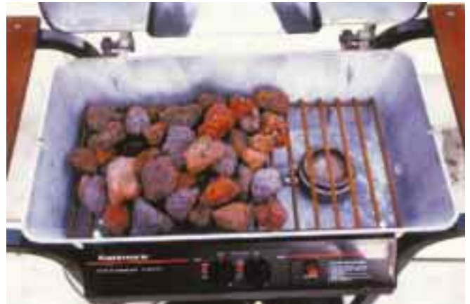
Above The burner installed in barbecue

Press the burner ring into the gas distribution base using a mechanical press. A completed burner is shown in the photo. The lava rocks have been removed from one side for clarity.