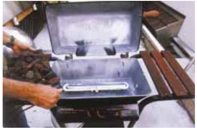
Above: By removing the cooking grill and lava rock support, you can see the stainless steel propane burner.

Propane barbecues are more convenient and produce less emissions than charcoal models. Propane also eliminates waiting while the coals get hot.